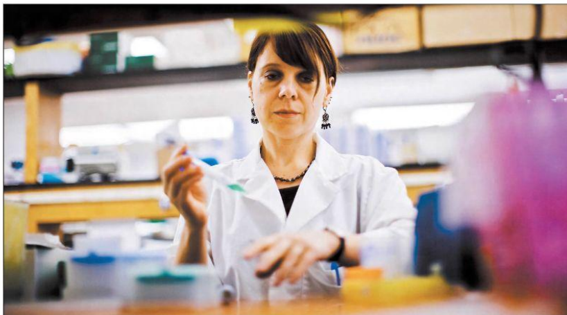
The number of food allergen tests done at the University of Nebraska for the Tribune was more than U.S. regulators have done in years.