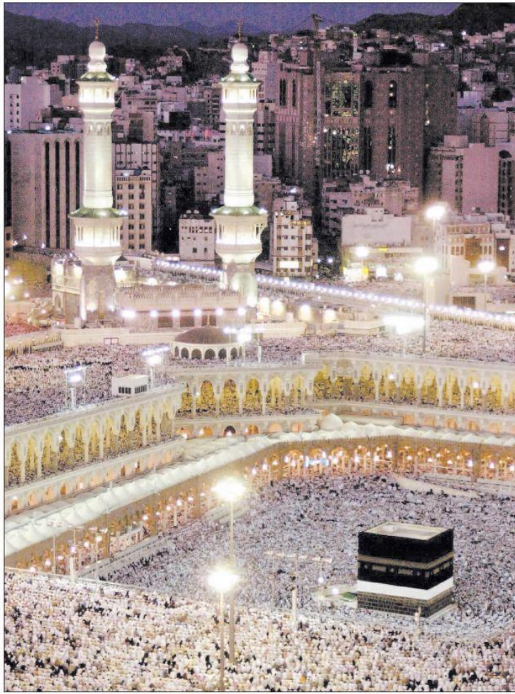
Muslims pray in Mecca, Saudi Arabia, during hajj. One of the basic tenets of Islam is that worshippers should try to make a pilgrimage to Mecca at least once in their lifetimes.