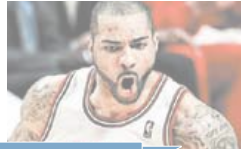
Series shifts back to Philadelphia for Game 6 Chicago Sports

WINNER OF THE 2012 PULITZER PRIZE FOR COMMENTARY